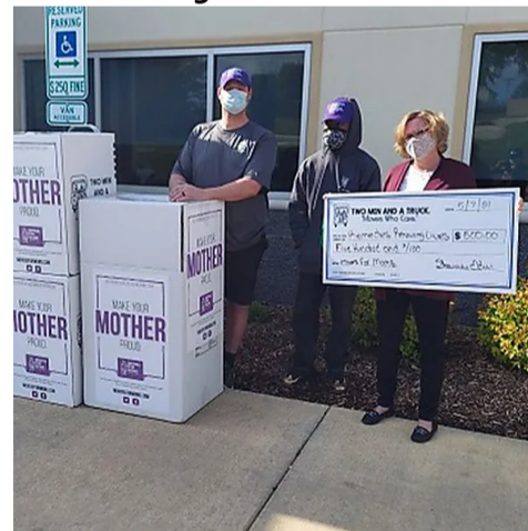
'Movers for Moms' program collecting donations