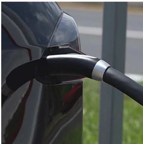
Interstate signs to mark Illinois electric-vehicle stations