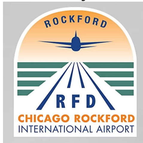
Chicago Rockford International Airport to get $2.8M for improvements