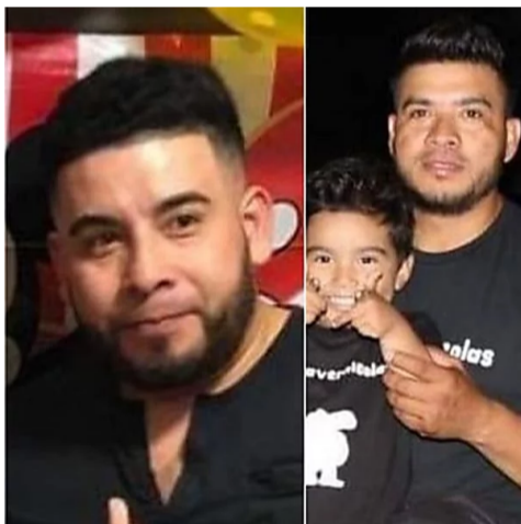
Family of men who died in explosion near Starved Rock hire law firm