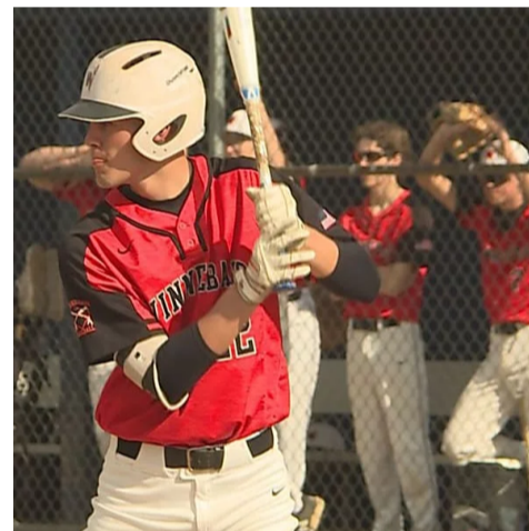
Winnebago beats Rockford Christian for fifth straight win