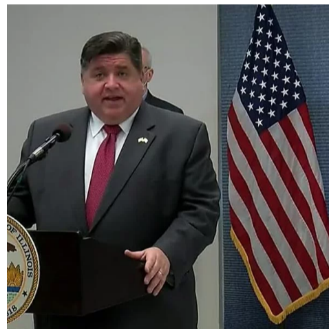
Pritzker to revise executive orders after new CDC mask guidelines