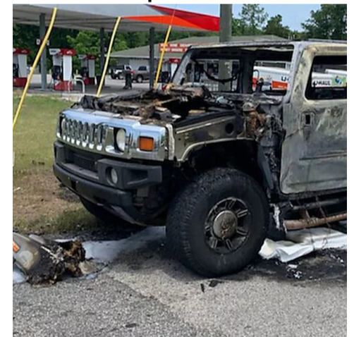
Gas stockpile, SUV go up in smoke