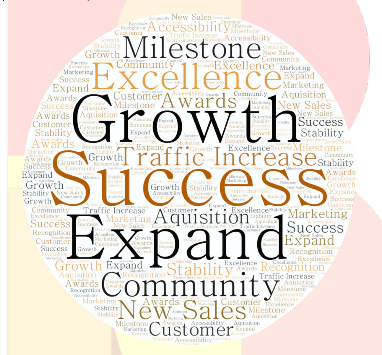
Figure 3: This word cloud represents the major accomplishments highlighted by downtown Beloit businesses in the recent survey. Words like expansion, growth, and new products reflect a collective focus on business development and customer engagement. Other frequently mentioned terms, such as sales increase and community engagement, emphasize the positive impact these businesses are making within the community. The word cloud visually showcases the diversity of achievements, from infrastructure investments to awards and recognitions, illustrating a dynamic and resilient downtown business environment.

Physical Expansion and Infrastructure Investment: Several respondents indicated investments in infrastructure to support their business growth. For example, a business acquired its own building and is now updating it to improve accessibility, which reflects a commitment to customer experience and long-term operational stability.